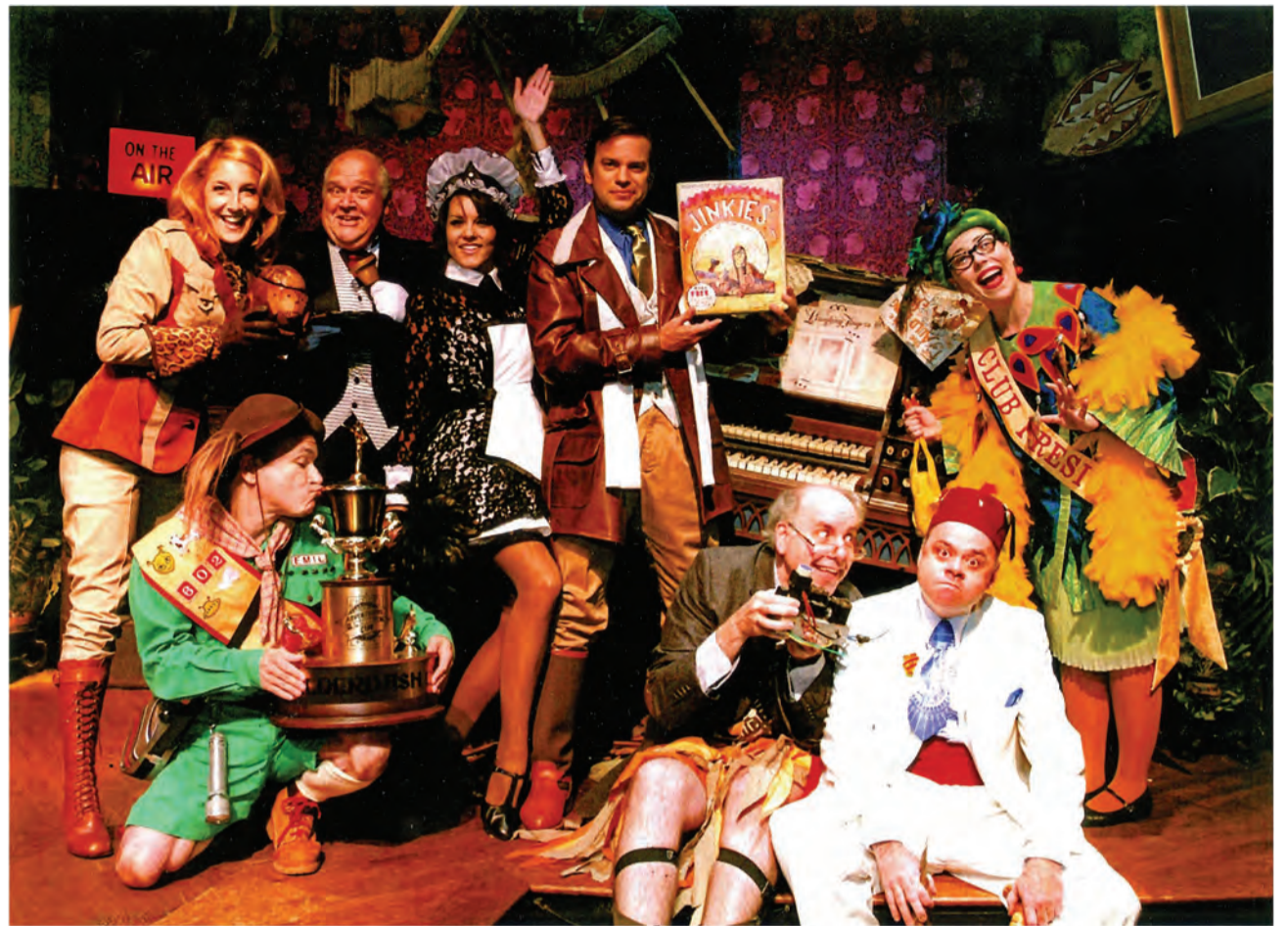
Cast of the Adventurers Club.

Madame Zarkov, the rarely seen gypsy psychic