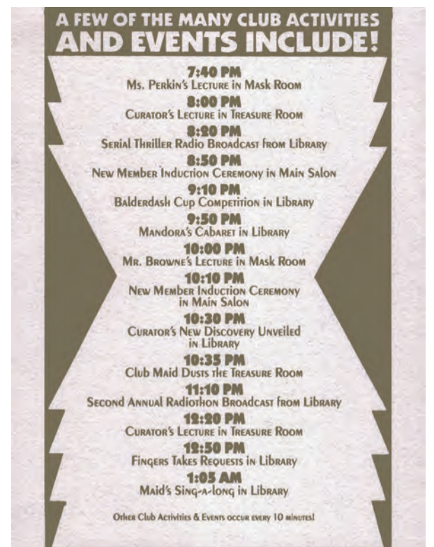
Adventurers Club nightly schedule demonstrates many shows that were performed each night.