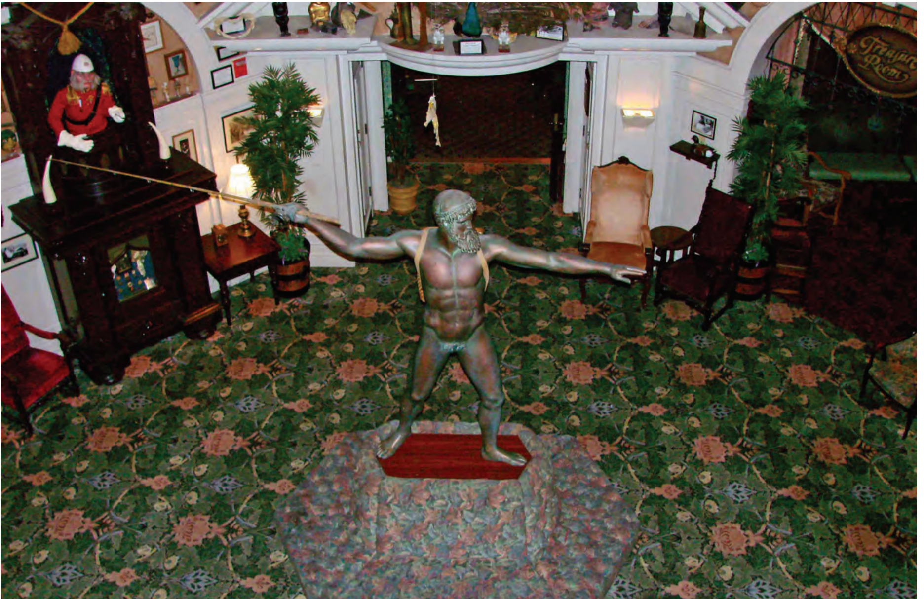
Main Salon of the Adventurers Club.

and talking about their latest expedition to Papua New Guinea, but I certainly loved the building!”