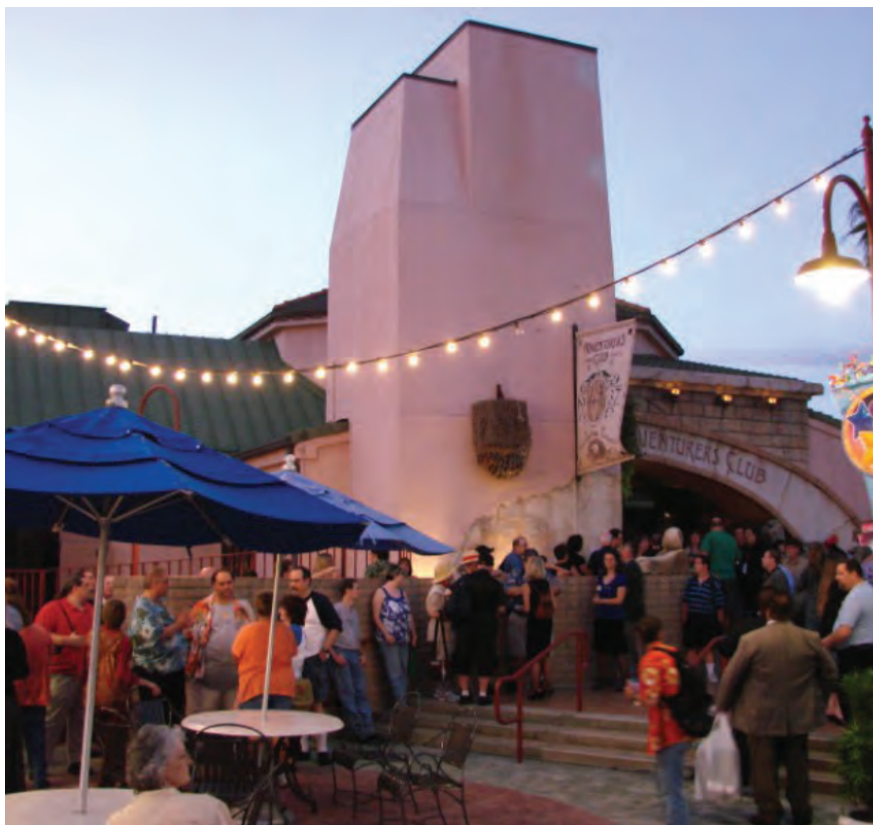
The 2009 Adventurers Club Reunion at Downtown Disney.

About a year after the Adventures Club officially