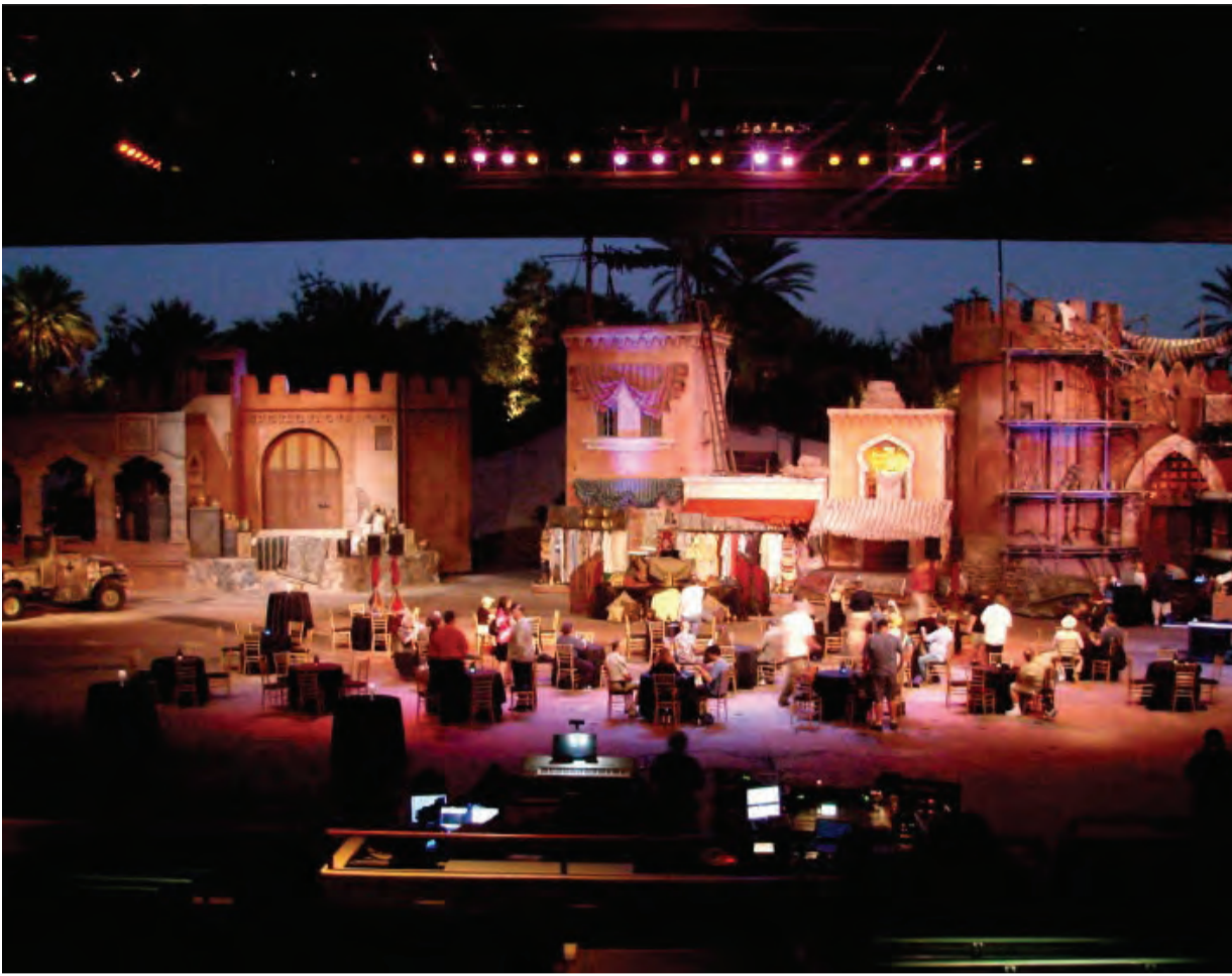
A reunion event held on stage at the Indiana Jones Stunt Spectacular.

Adventurers discovered that year that no matter the setting, their camaraderie lived on.